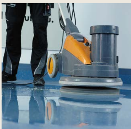
Clean the flooring with nora pads