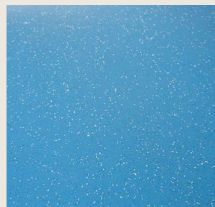
A clean result